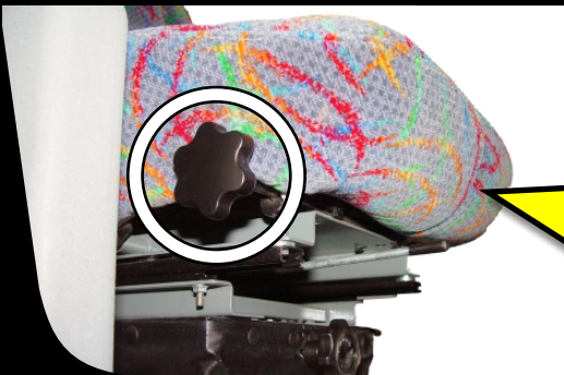
Cushion Height Adjustment