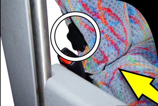
Lumbar Support Adjustment