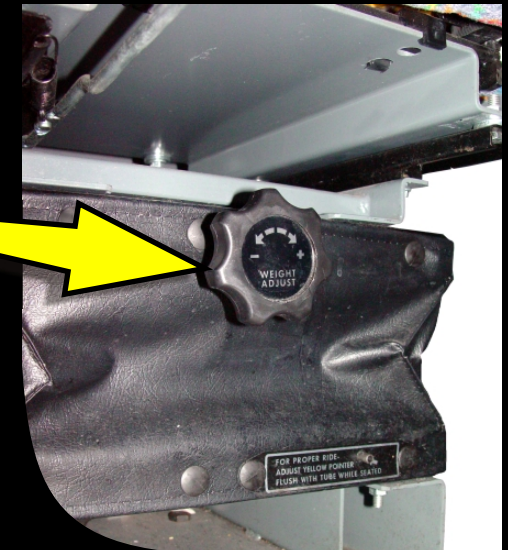
Height~Weight Support Adjustment